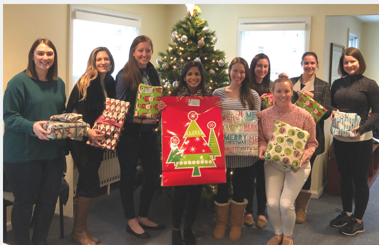
The DIAD Committee turned HQ into Santa's Workshop for an afternoon in December, wrapping our members' generous donations to bring holiday cheer to more than 35 families in need.

In December, we hosted our first Resume Review and Career Clinic in partnership with Women's Mentoring Network. Over the course of the two-hour clinic, our members met one-on-one with women to provide feedback on their resumes, act as a sounding board, and help identify their strengths and how they can best market themselves to be successful as they re-enter the workforce. We're hosting our second Resume Review and Career Clinic later this month and invite everyone to experience first hand how helping women in this way can be extraordinarily rewarding.