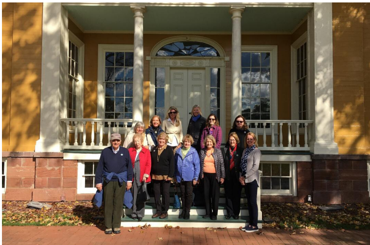
In October, we toured Boscobel House, a museum on the shores of the Hudson featuring decorative art from the Federalist period.