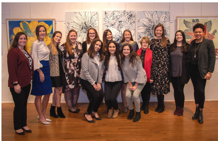
Signature Project- LiveGirl Gratitude Reception in December with JLSN, LG and LGL students

Please read on to the DIAD section to learn more about the other nonprofit organizations we've partnered with as part of JLSN Empowers.