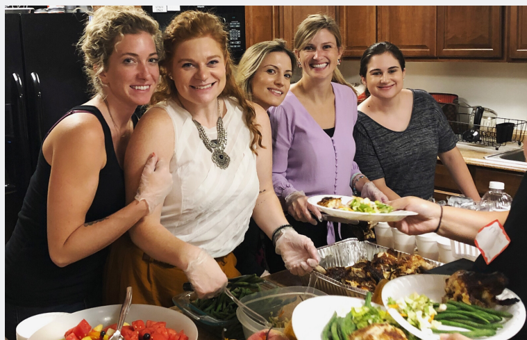
JLSN Members prepared and served dinner to families at Inspirica