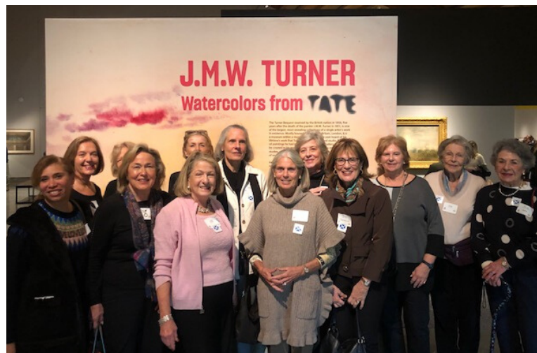
Several Sustainers joined the Greenwich League to see the J.M.W. Turner Watercolor exhibit at Mystic Seaport in November.