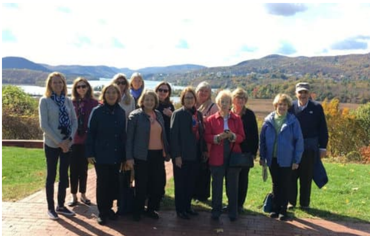
After our Boscobel tour, we had lunch at the Hudson House in Cold Springs, NY.