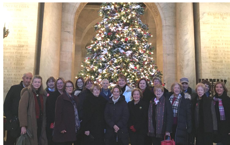
We took a "sold out" tour of the New York Public Library, followed by lunch at the Bryant Grill, in December.