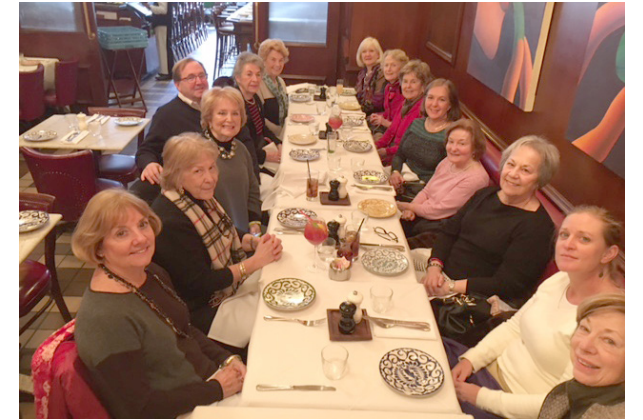
Sustainers and their guests enjoyed brunch at Fiorello's Restaurant before the opera backstage tour.