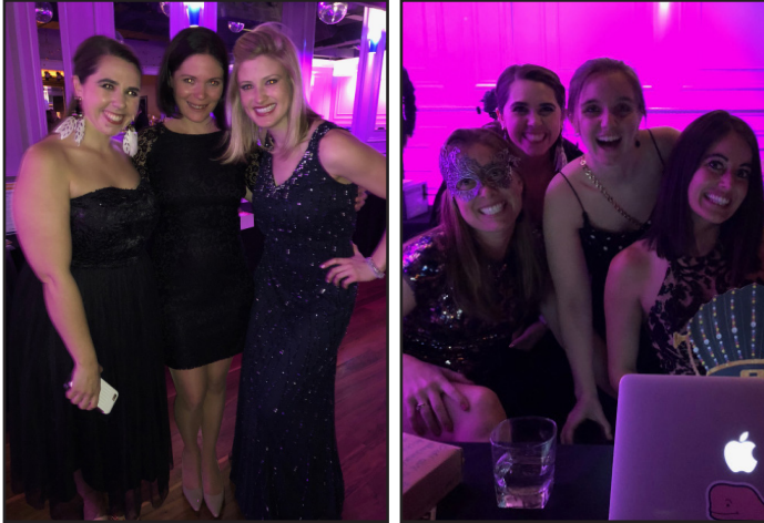
Spring Spirits fun!

Members, spouses and friends of JLSN had a wonderful time at Spring Spirits 95th Anniversary Masquerade on April 14. From exciting items up for grabs in the silent auction to delicious food from Garelick and Herbs and great masks, it was certainly a night to remember!