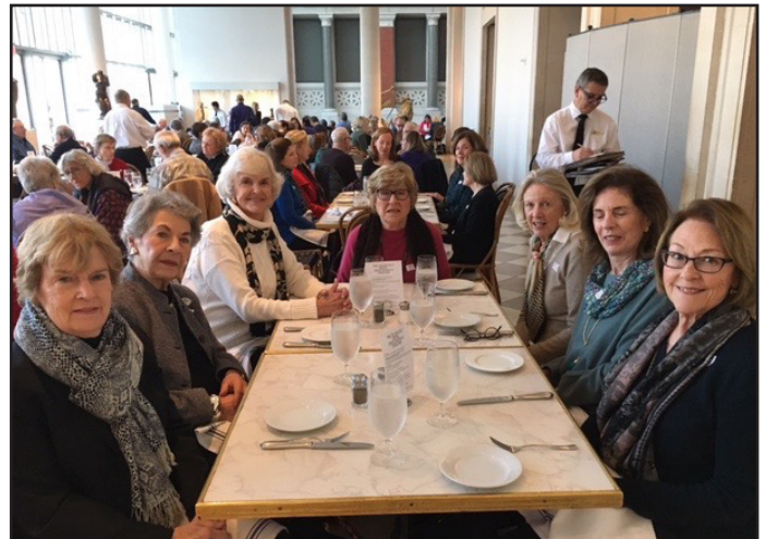
The Going Places group enjoyed lunch at the Petri Court Cafe after a special docent-led tour of the Metropolitan Museum of Art in December

Enjoying holiday highlights was the itinerary for the Going Places December outing. The day began with a tour of the Metropolitan Museum of Art's world famous collections of Impressionist and Post- Impressionist Paintings and viewing the festive annual Christmas tree display. Afterward, the group lunched in the Petri Court Café overlooking Central Park, then strolled down Fifth Avenue to see the famous Rockefeller Center holiday tree.