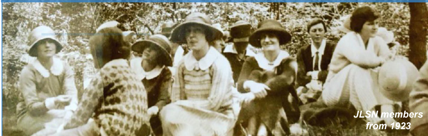
JLSN members from 1923