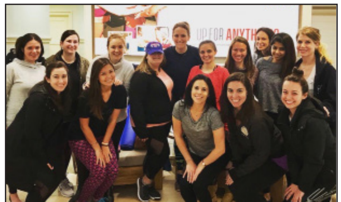
#FirstThursday Yoga at Athleta