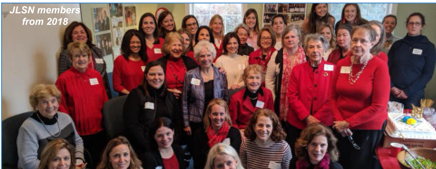
JLSN members from 2018

To commemorate the milestone, JLSN has been using the tag #JLSNcheerstothetwentyfifthyears on social media!