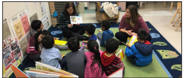
JLSN volunteers at our 4th Family Literacy Night of the year. 64 kids and 38 adults attended.