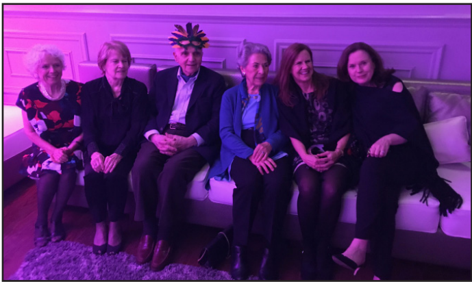
Sustainers enjoying the evening at Spring Spirits